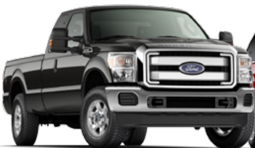
F-550 Super Duty

Ford F-250, F-350, F-450, F-550 Super Duty, Ford Expedition, Lincoln Navigator